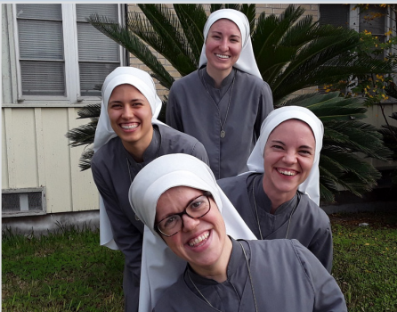
SOLT novices in Robstown, TX..